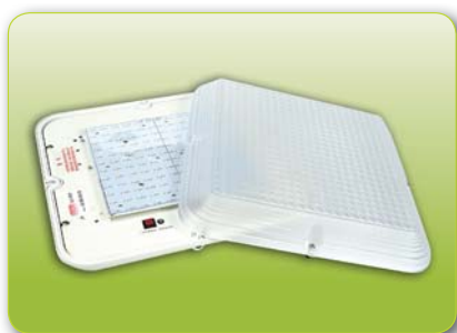
“CRYSTALITE” Cat. CC-SQ-LED-N3

The “SQUARE & CIRCULAR LED” series is maintained type, IP65 weatherproof emergency LED lighting system. The prismatic diffuser and housing are made of polycarbonate and metal respectively. It contains all the emergency lighting control gear components such as LED Driver and battery for high efficiency operation of the emergency LED Lamps. The weatherproof emergency fluorescent fitting complies with FSD PPA 104A (4th revision) including 850°C hot wire test.