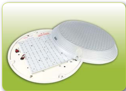
“CRYSTALITE” Cat. CC-CR-LED-N3

Emergency LED Lighting system, Circular type